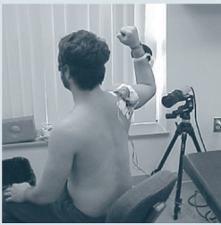
Figure 1. Setup of shoulder proprioceptive testing with vibration stimulus applied to the posterior shoulder musculature.

A significant joint by treatment by angle interaction was identified for absolute error and constant error. The absolute error scores were significantly higher following vibration in the elbow [without 3.7^\circ \pm 2.6 , with 14.7^\circ \pm 5.2 , P = .002 ] and the shoulder [without 3.8^\circ \pm 2.0 , with 8.0^\circ \pm 4.8 , P > .001 ]. (Figure 2.) The elbow repositioning error was significantly higher than the shoulder repositioning error following the vibration stimulus condition. (Figure 2.)